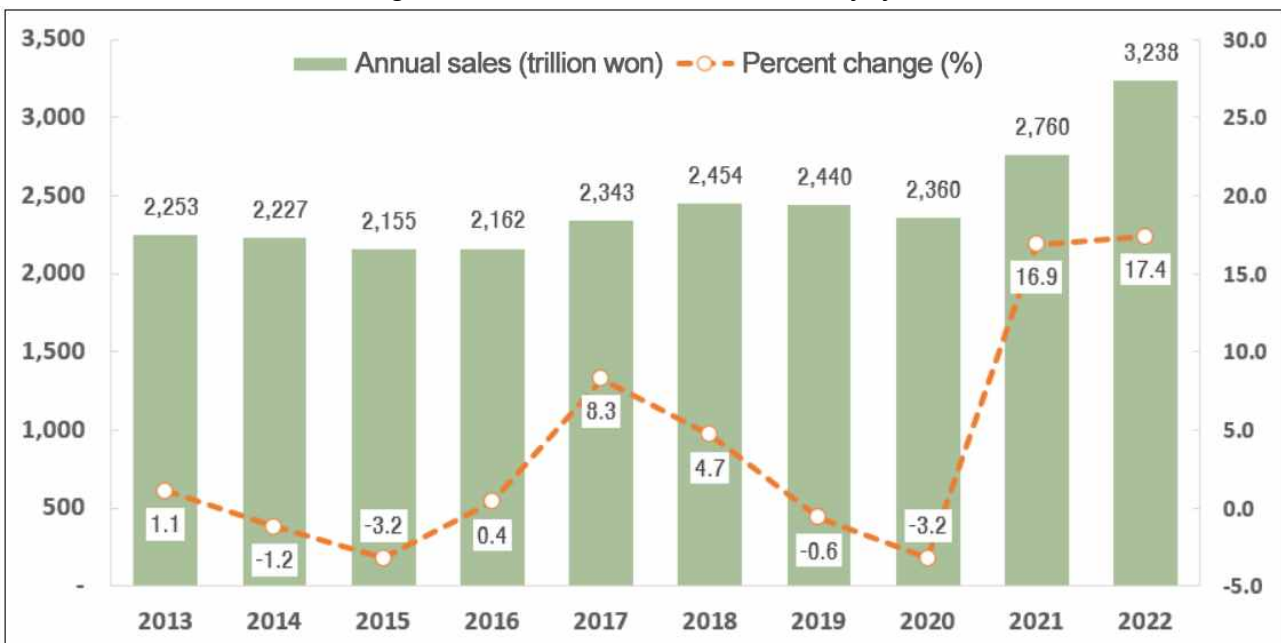
<Figure> Trend in annual sales by year