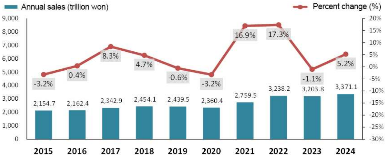
<Figure> Trend in annual sales by year