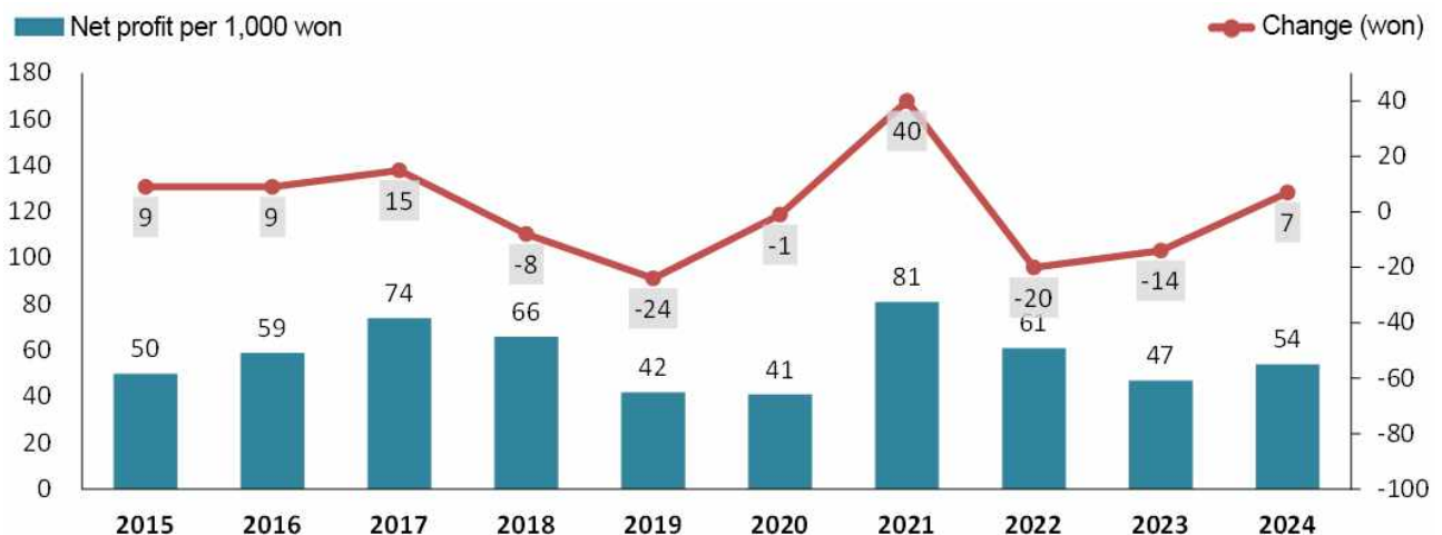
<Figure> Trend in net profit before the corporate tax per 1,000 won of annual sales