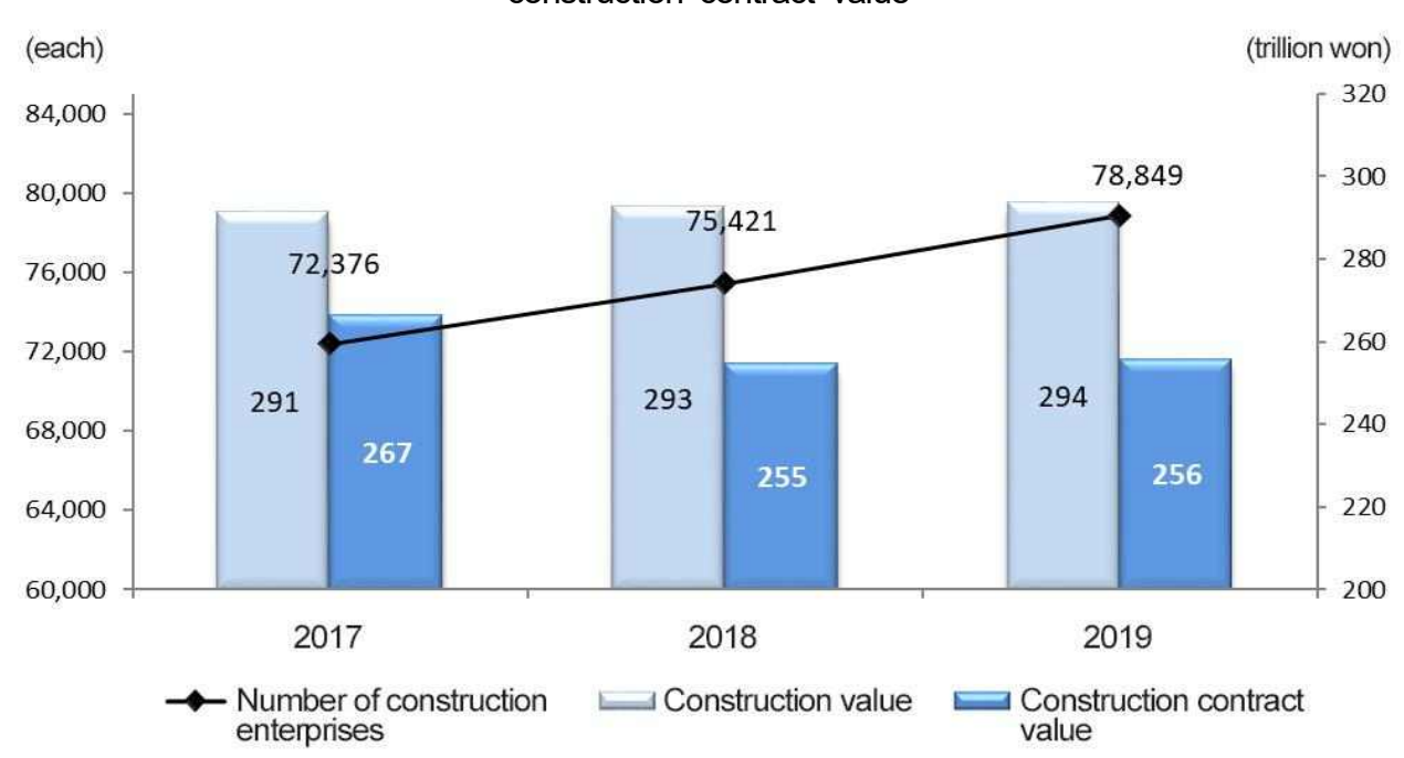
<Table 1> Number of construction enterprises, construction value and construction contract value